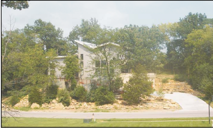
FRONT VIEW FACES WEST